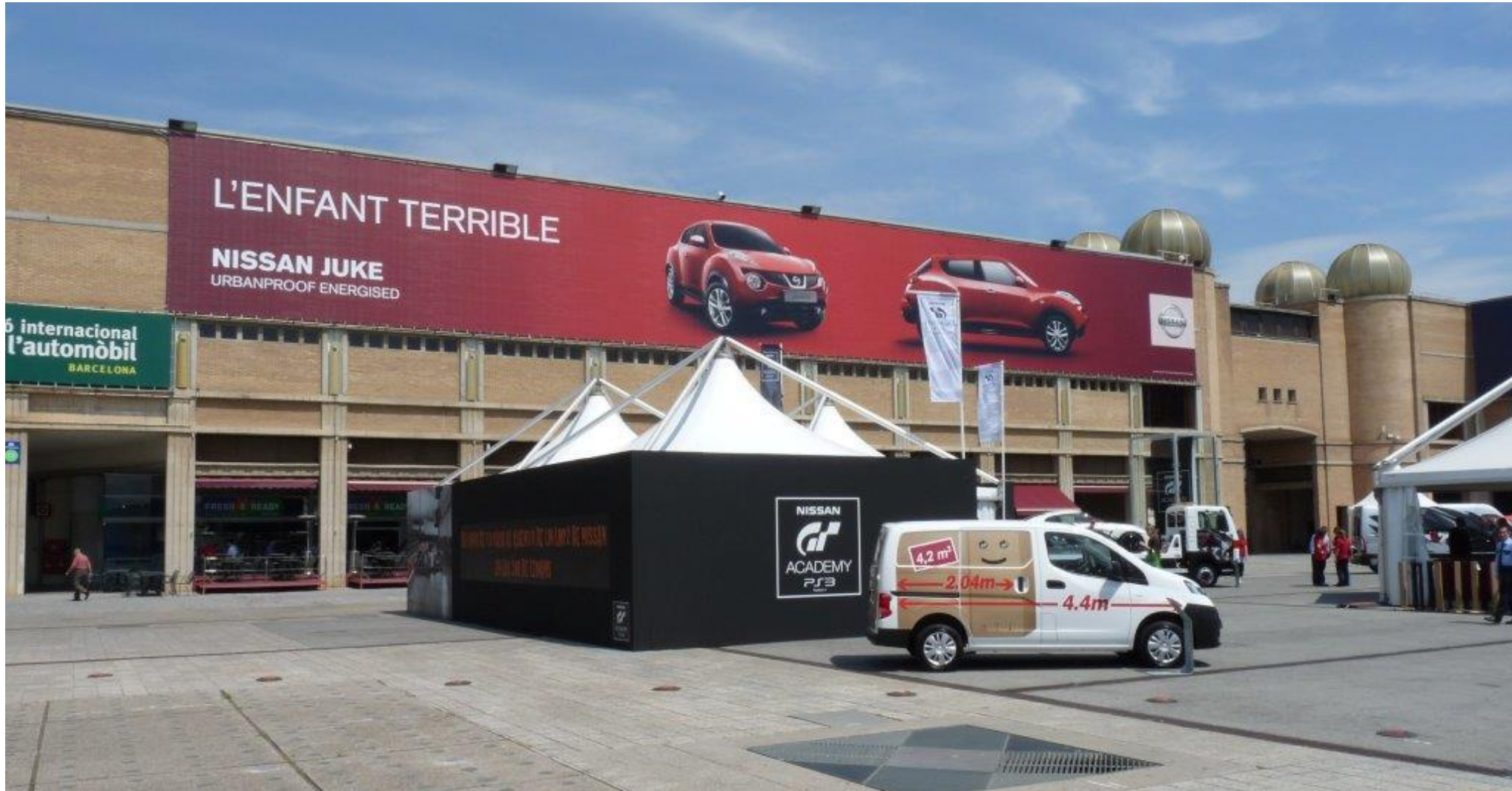
VS2 – Billboard Plz. Universo - Frontis Hall1B (52 x 6,50 m.)