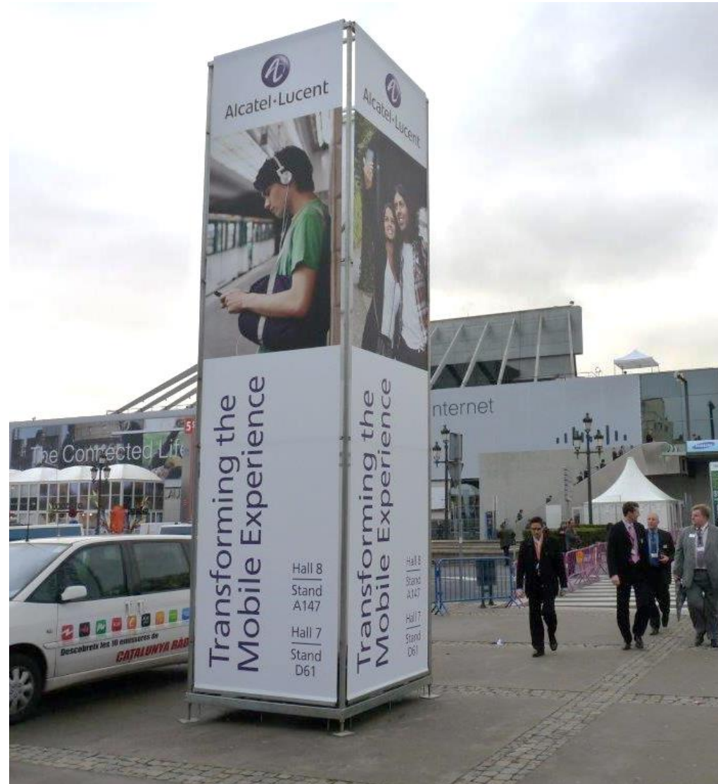
TCA – 4 sided tower 1,50 x 6 m.