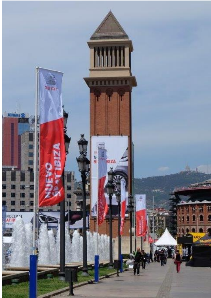
MA – Flagpole 7 m. with flag 1 x 4 m.