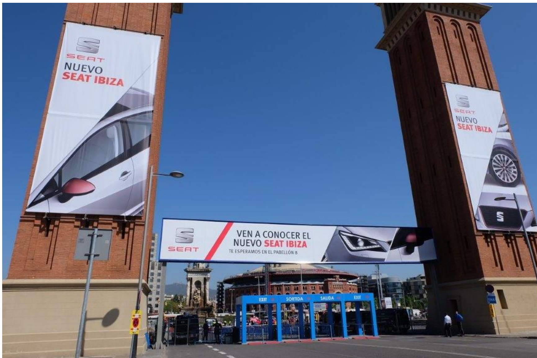
TV – Banner on Torres Venecianas (6 x 14 m.)