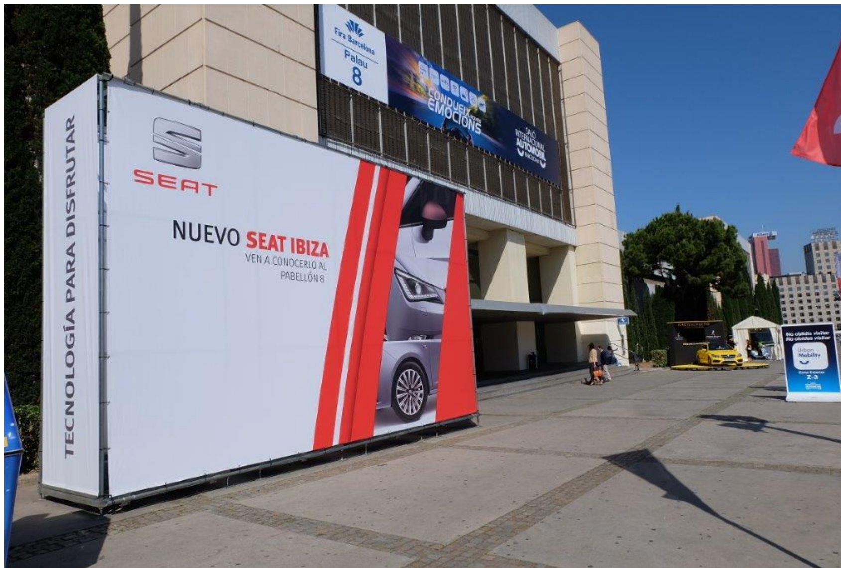
CP8 – free standing 8 x 5 x 1,50 m.