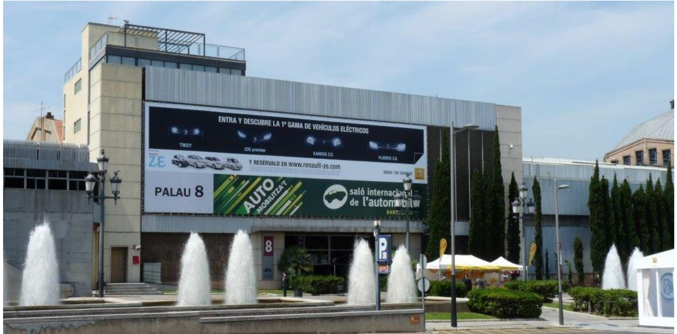
LP8.3 – Banner above main entrance Hall 8, next to Rius i Taulet (24,80 x 5 m.)