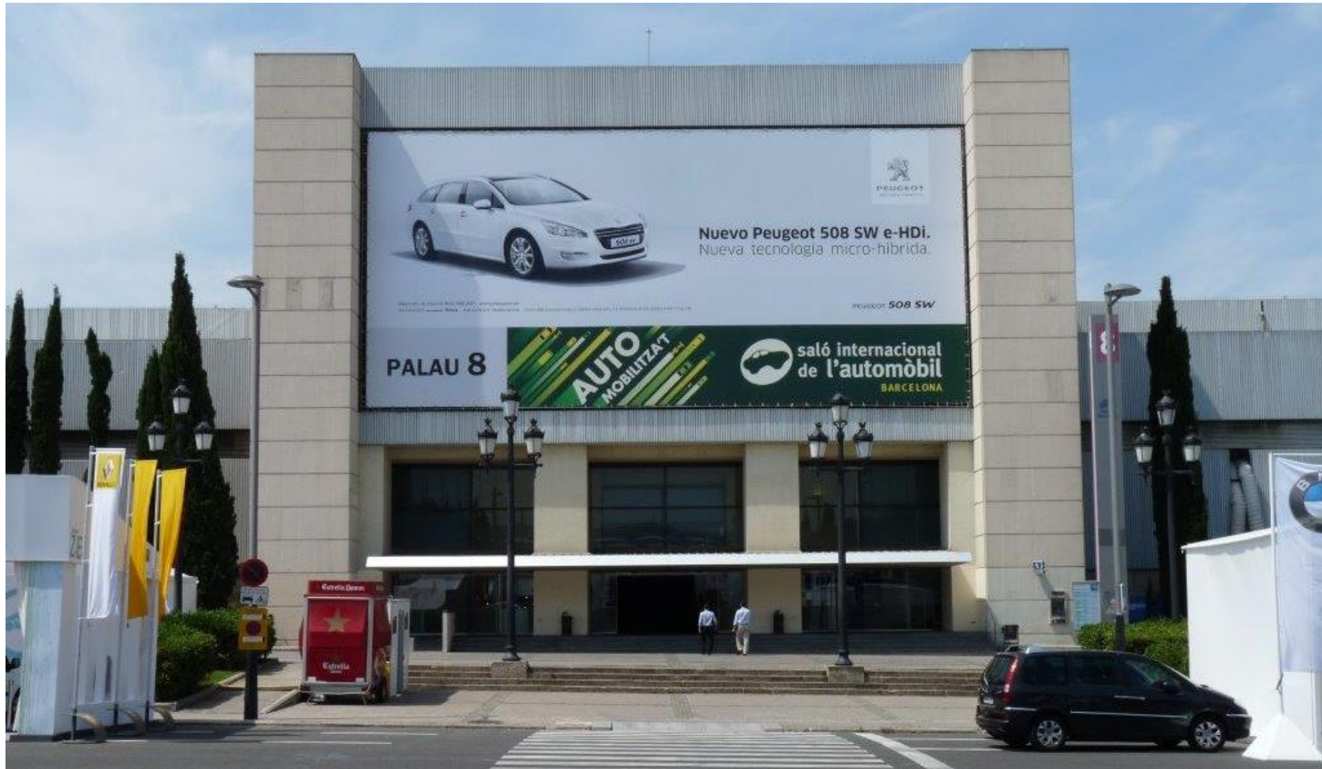
LP8.2 – Banner above main entrance Hall 8, central (22,50 x 7,50 m.)