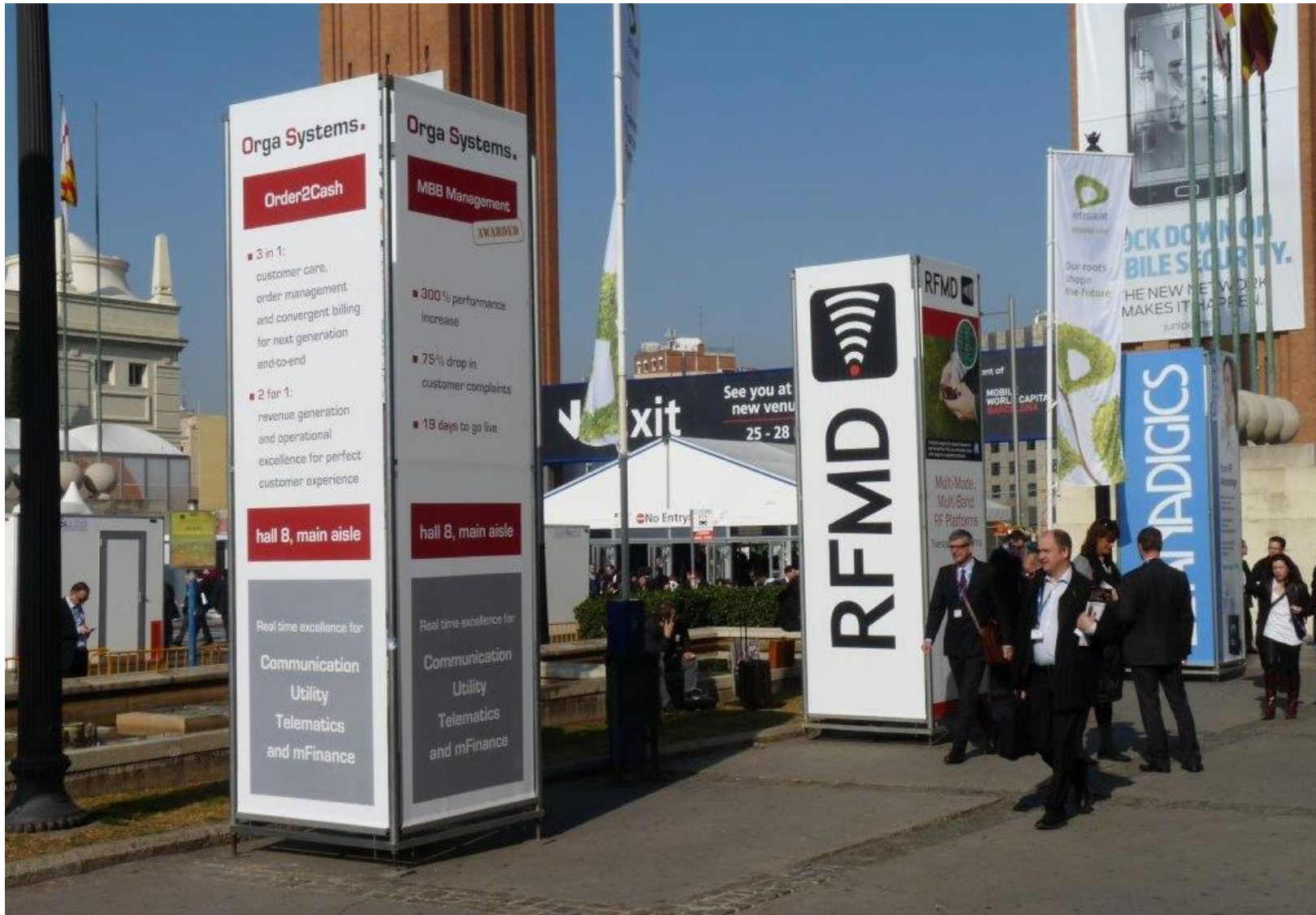
TC – 4 sided tower 1,15 x 4 m.