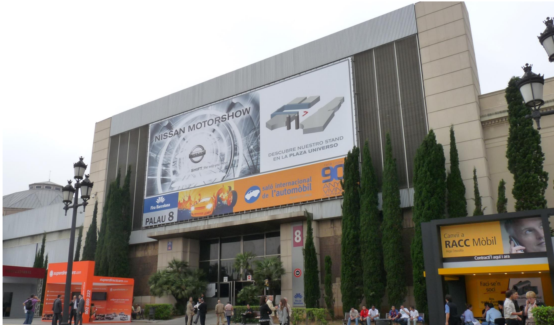
LP8.1 – Banner above main entrance Hall 8, next to plaza España (21,70 x 7,60 m.)