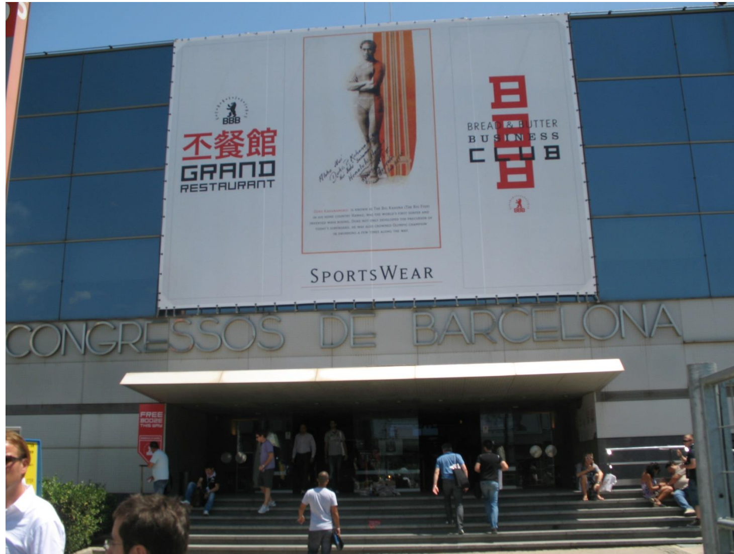
LC – Banner on palacio de congresos 15 x 7,50 m.