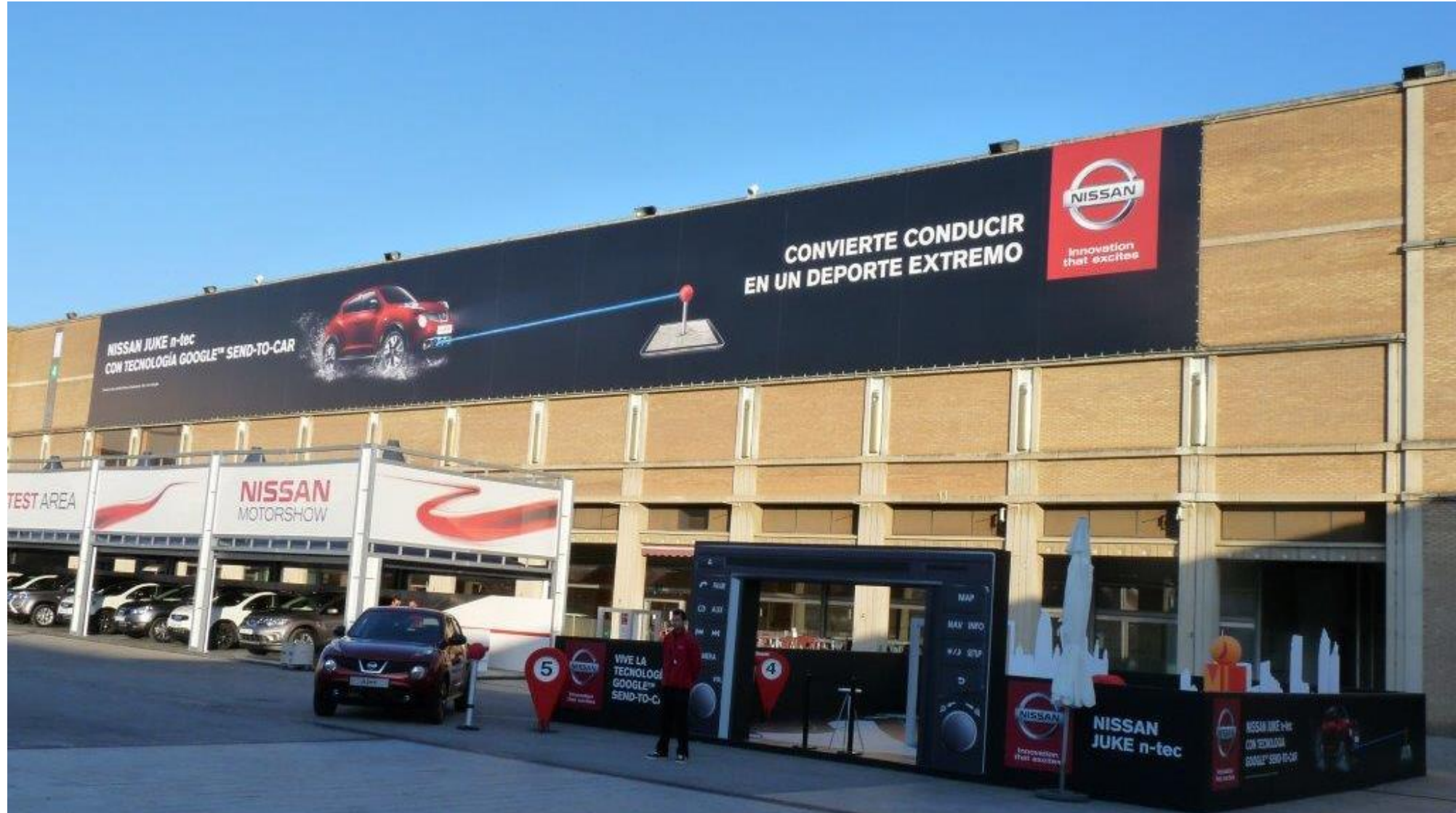
VS5 – Billboard Plz. Universo - Frontis Hall4 (62,40 x 6,50 m.)