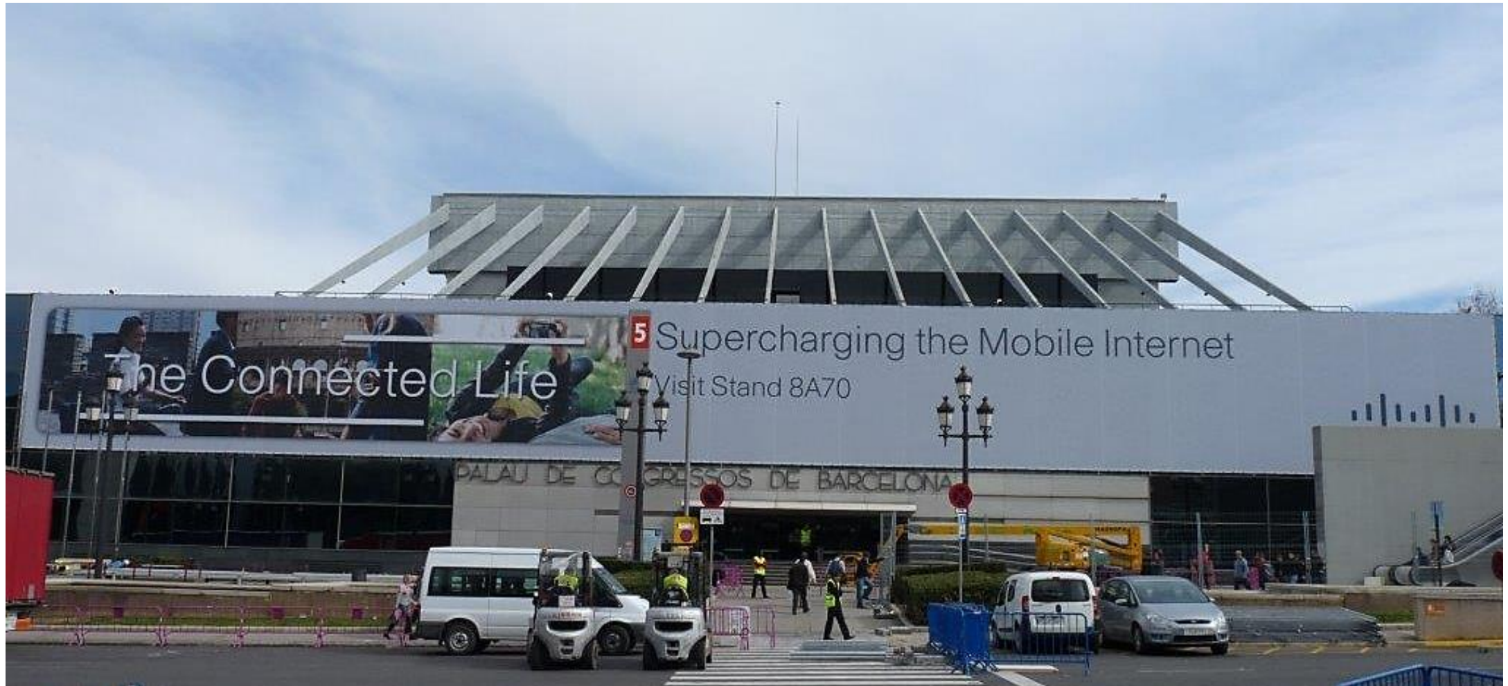
LC – Banner on palacio de congresos 70 x 7,50 m.