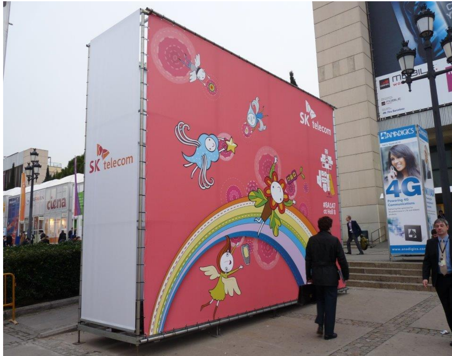
CP6 – free standing 6,50 x 5 x 1,50 m.