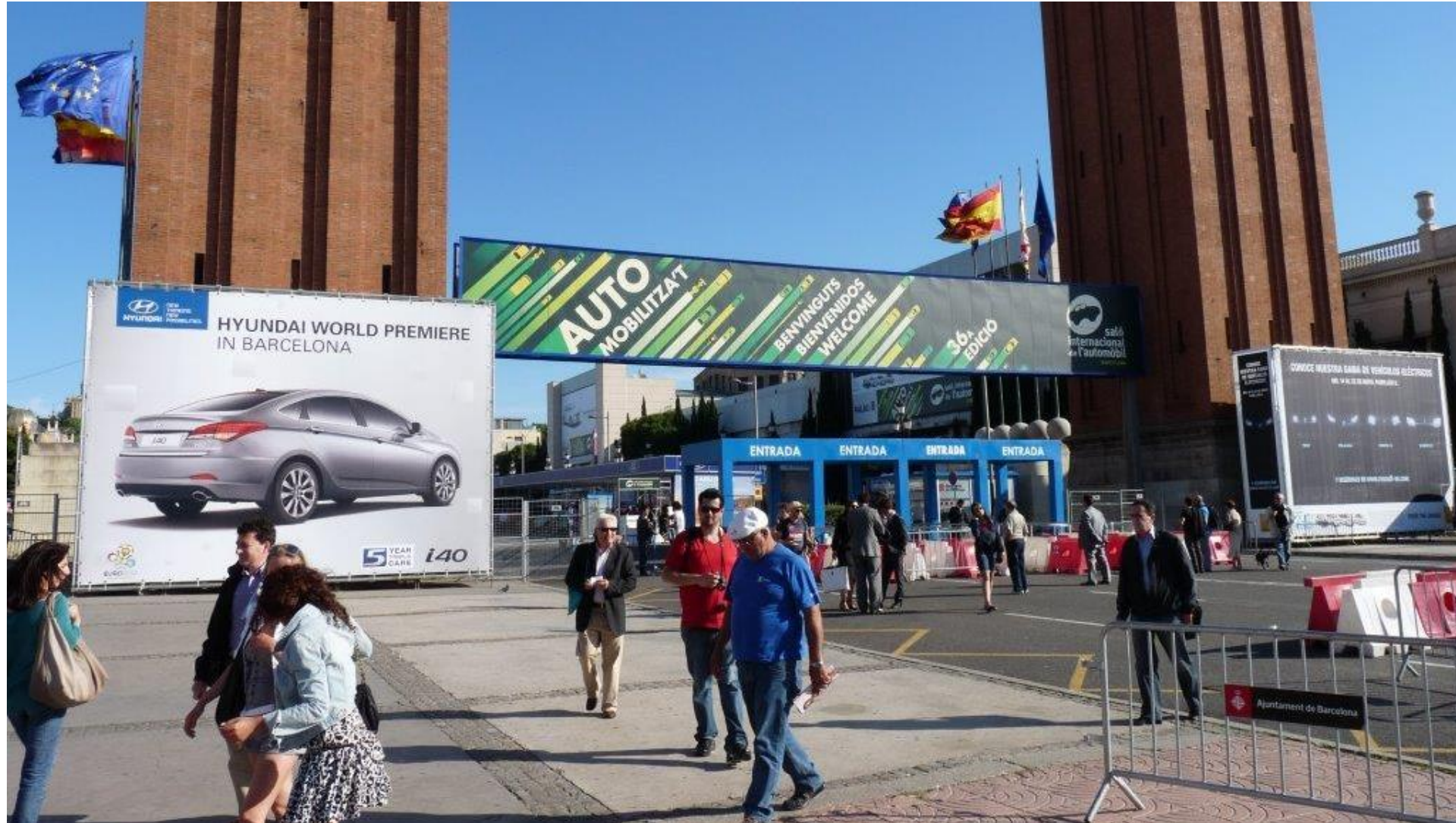
CPTV – Free standing (8 x 6 x 1,50 m.)