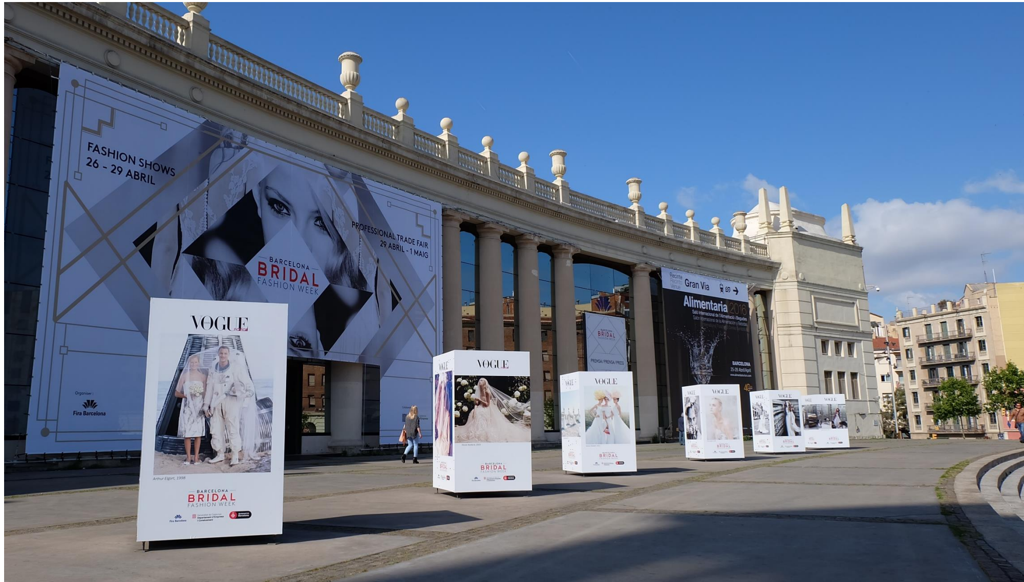
CUBE – 4 sided tower 1,20 x 2,04 m.